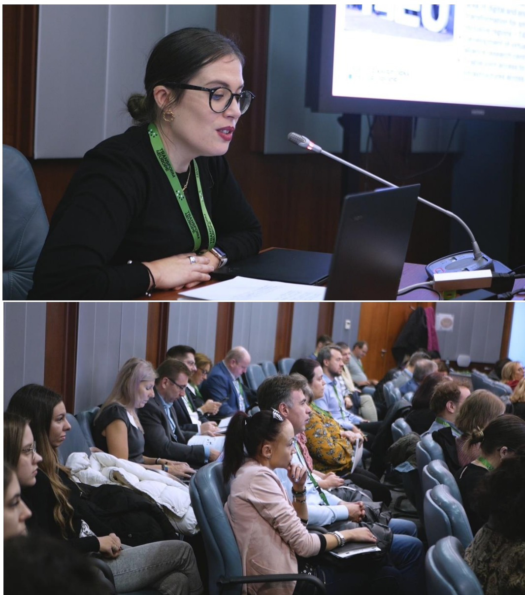
Figure 3. Participants in the second T4ERI Stakeholders' Assembly (15 November 2022, Sofia University St. Kliment Ohridski)

A short video film was prepared for dissemination purposes presenting key moments of the event and parts of interviews with several participants from the partner universities: https://www.youtube.com/watch?v=OgLIG8OWhhw